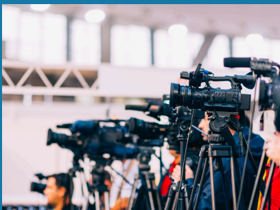
Publishers and Media