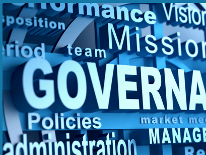
Government and Agencies