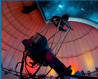
Research Centres and Facilities